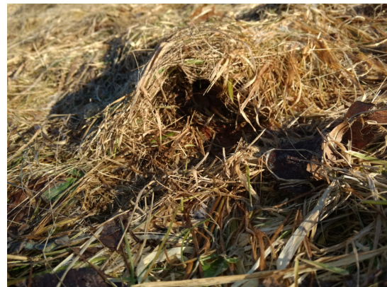
Exposed vole nest

As winter yields to spring, go outside and get away from the usual rat race; evidence of the vernal vole race awaits.