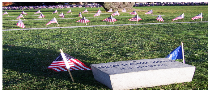
NH graves at Soldiers' Cemetery in Gettysburg

The Civil War Roundtable of New Hampshire welcomes anyone with an interest in the American Civil War who would like to be with others who share the same desire to learn more of this time in American history. We are an informal club with the only requirement being a Civil War enthusiast. If you or a friend has an interest in the American Civil War, we invite you to come check us out.