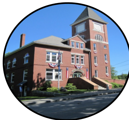
Epping Town Hall made from Epping bricks